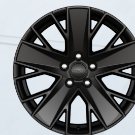
20-inch Gloss Black-Painted Aluminum (Standard)