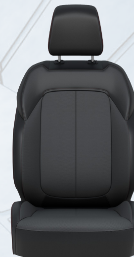
Sicily Leatherette with Axis II Perforations, Blue Agave/Wine Dual Accent Stitching and Rouge Piping — Global Black (Standard)