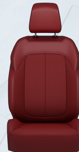
Sicily Leatherette with Axis II Perforations, Blue Agave/Light Slate Gray Dual Accent Stitching and Frost Piping — Black/Radar Red (Available)