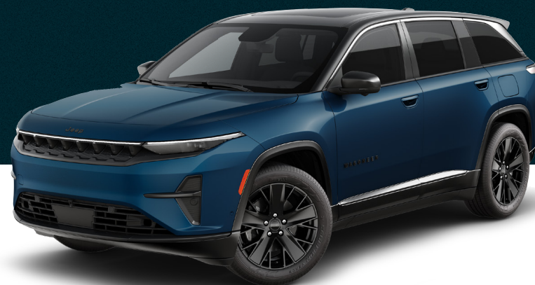
Fathom Blue Pearl