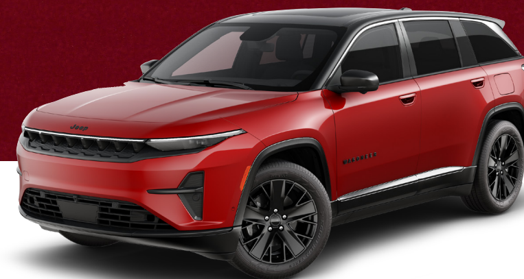
Red Hot Pearl